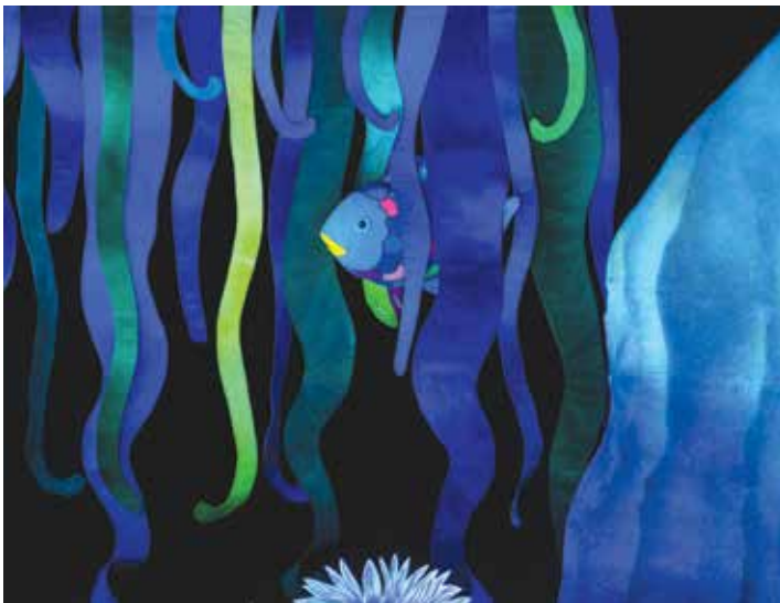
Homecoming for The Rainbow Fish